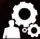
SOW Technical Services