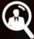
Recruitment and Staffing

Our main differentiator is the ability to provide our clients with effective services, great solutions and the best talent.