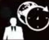
SOA - Architecture and Integration